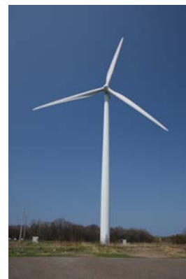
Figure 3b Wind turbines used for wind power generation.