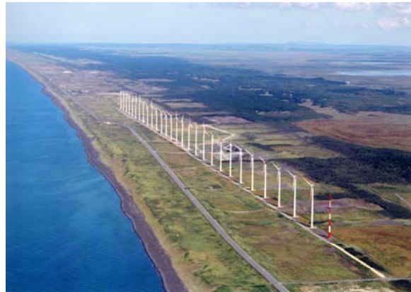
Figure 2: An example of a wind farm

Figure 2 shows a wind farm for wind power generation. List and explain two reasons below why this is a good site for wind power generation.