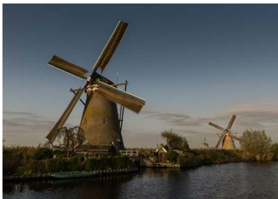
Figure 3a Traditional windmills.

Compare the shapes of the blades for a traditional windmill and a wind turbine shown in Figures 3a and 3b, respectively. Explain from a mechanical engineering point of view two features of blades that characterise wind turbines for wind power generation.