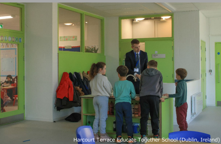
Harcourt Terrace Educate Together School (Dublin, Ireland)

Free/ Simultaneous interpretation between Japanese, English and Korean/ In-person(capacity of 300 people) and simultaneous online delivery