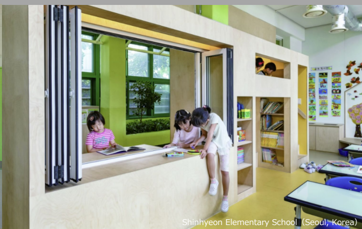
Shinhyeon Elementary School (Seoul, Korea)