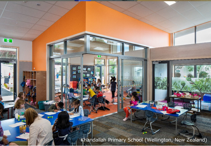
Khandallah Primary School (Wellington, New Zealand)